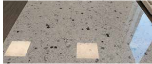
Terrazo DENALI Flooded