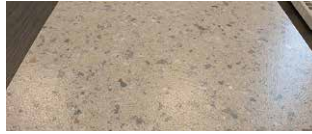
Terrazo ARMADILLO with LABFENDER 240