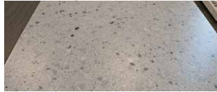
Terrazo DENALI with LABFENDER 240