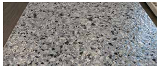
Signature 1/4" NIGHTFALL