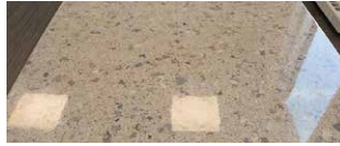
Terrazo ARMADILLO Flooded