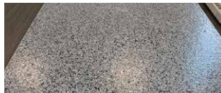
Signature 1/16" NIGHTFALL with LABFENDER